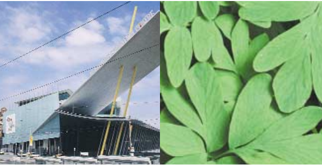
Left: Melbourne Exhibition Centre