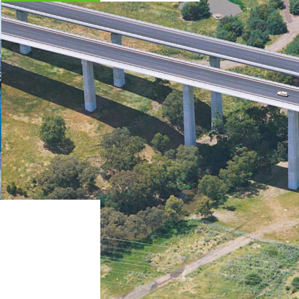
Above and front cover: Beacon Cove Marine works Right: EJ Whitten Bridge Far right: Bolte Bridge

The Ecoblend range of cements are specifically formulated to reduce the environmental impacts of cementitious binders used in concrete and stabilisation products. Ecoblend uses supplementary cements such as slag and flyash to ensure a significantly lower product life cycle impact; it provides the option of using a binder with significantly less material input, energy input and emission output. A very low embodied energy material can be created.